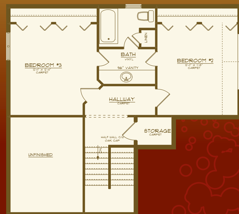
Upper Floor 680 Sq. Ft.